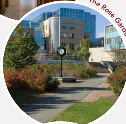
The Rose Garden