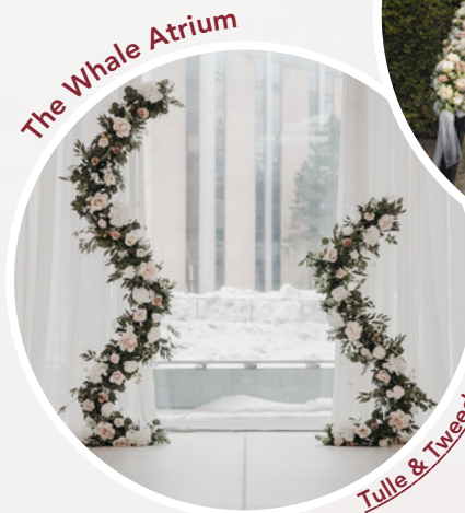
The Whale Atrium