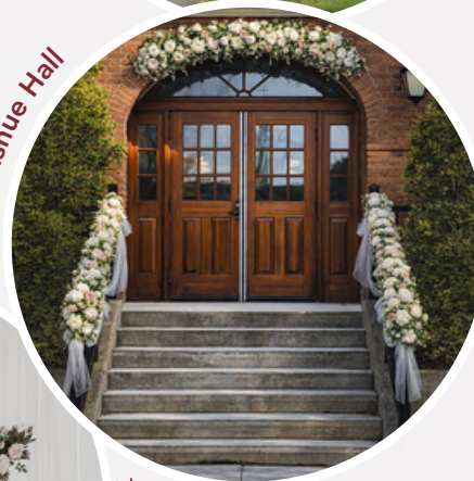
R. Gushue Hall